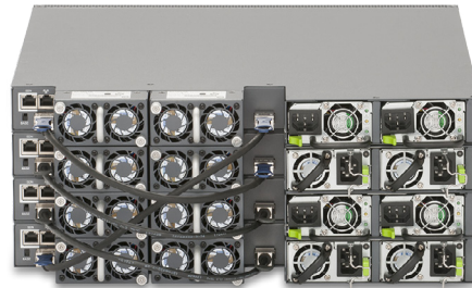
Figure 1. ERS 5900 stack back view with stacking cables, fans and power supplies

the backbone. In addition to the stacking cables, a return cable is also used to protect against any port, unit or cable failures.